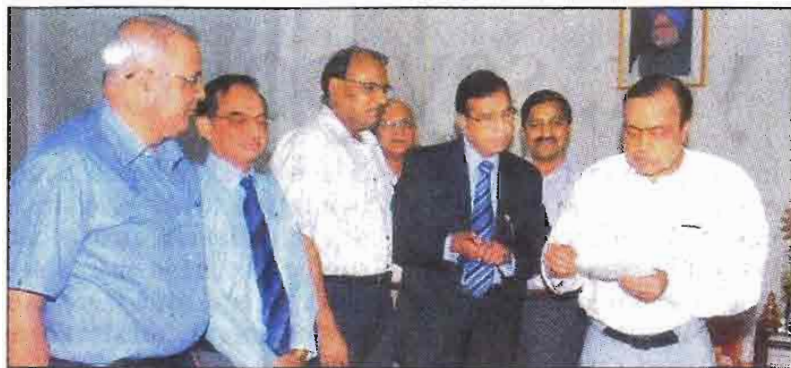
CMD, GAIL, U D Choubey, presents a cheque of Rs 87.88 lakh for Prime Minister's National Relief Fund to Union minister of petroleum & natural gas, Murli Deora, in New Delhi